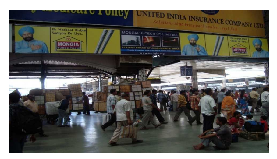
Figure 4: Mongia's Advertisement at Busy Howrah Station

Soon Sardar Gunwant Singh Saluja is going to launch Mongia packaged drinking water. He says, "I don't want to make profit from this product. Our target is initially to sell 20,000 bottles daily in the market.